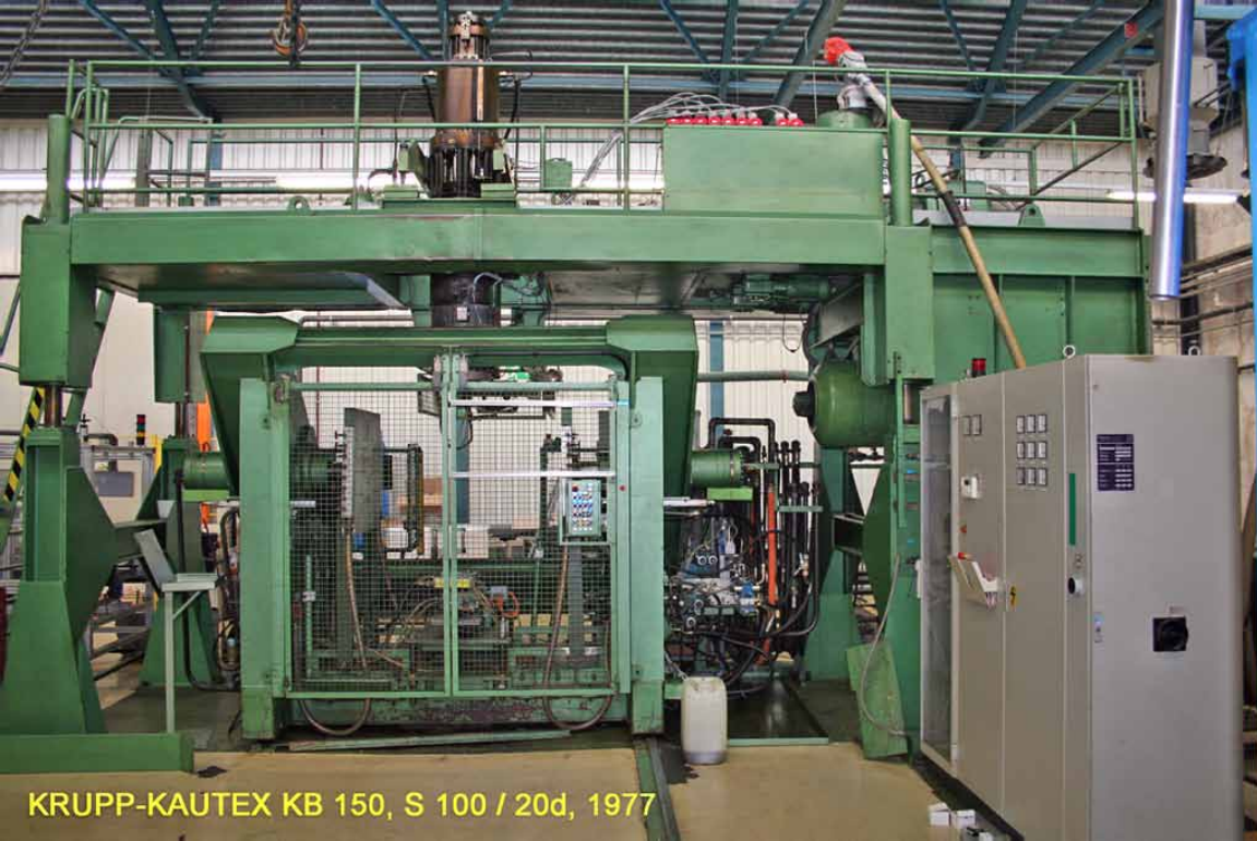
KRUPP-KAUTEX KB 150, S 100 / 20d, 1977