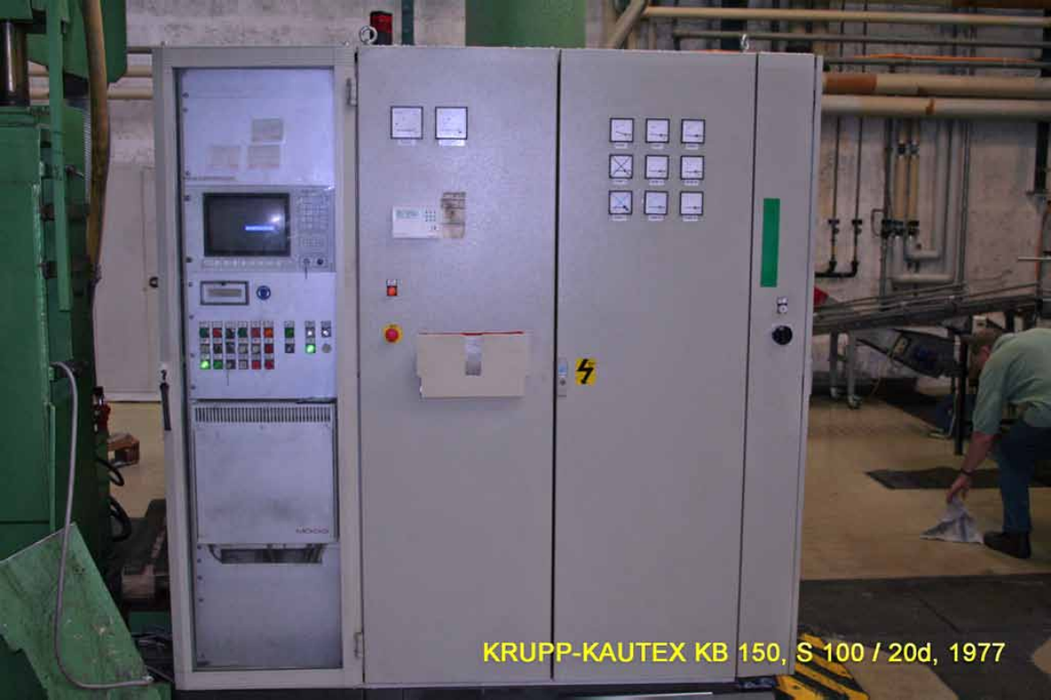
KRUPP-KAUTEX KB 150, S 100 / 20d, 1977