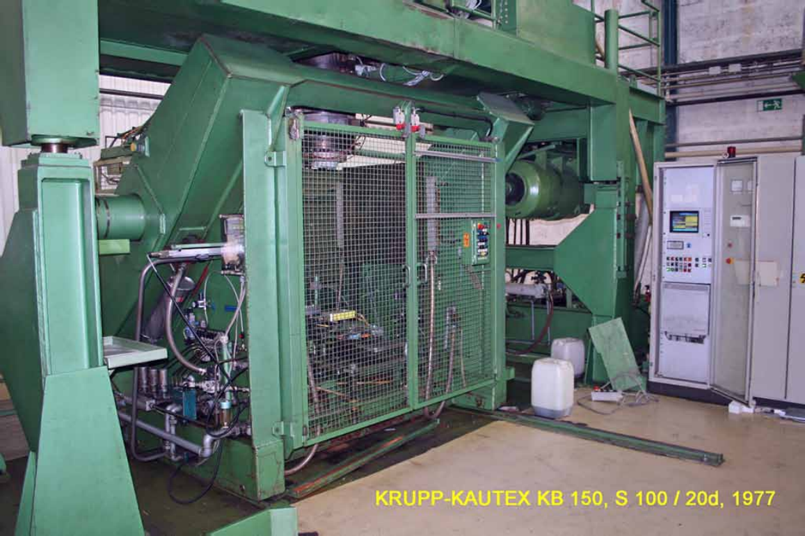
KRUPP-KAUTEX KB 150, S 100 / 20d, 1977