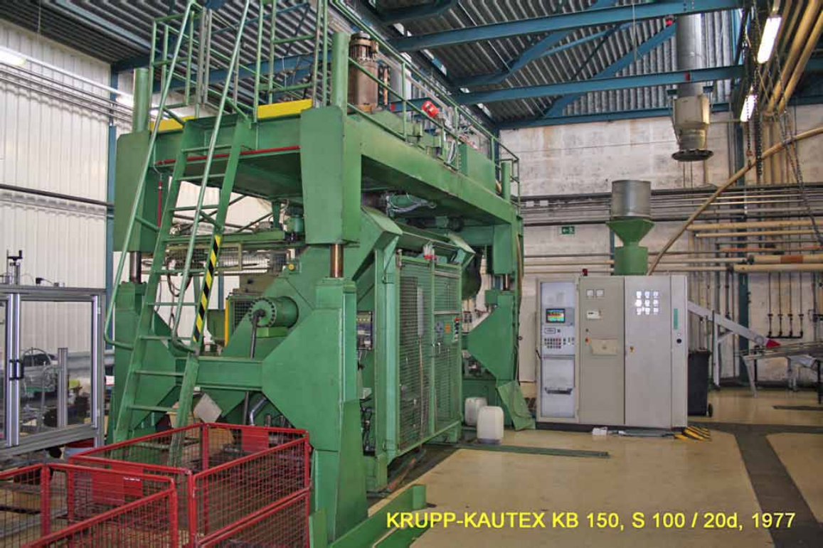
KRUPP-KAUTEX KB 150, S 100 / 20d, 1977